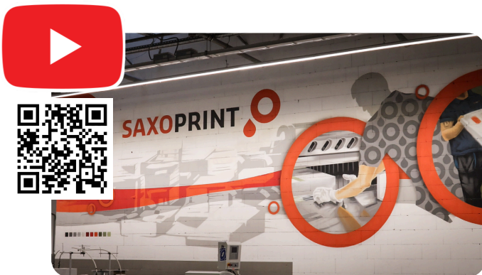
HORIZON SPOTLIGHT: SAXOPRINT