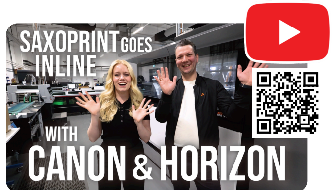
Inline System Spotlight Video